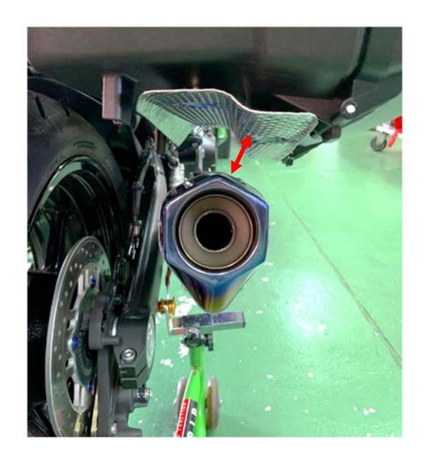
With the heat shield attached If you put your luggage in the pannier case, it will hang down due to its weight, so please secure a clearance of about the red arrow.